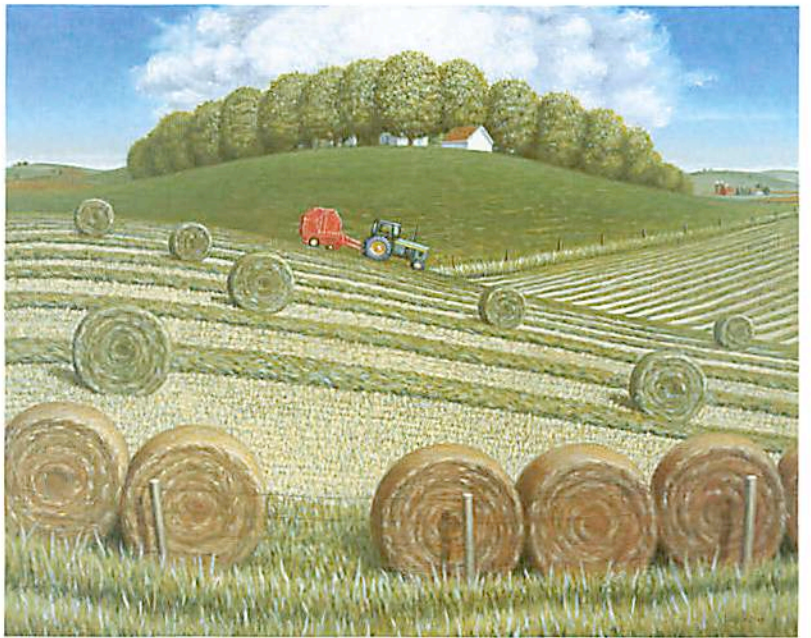
Summer Pattern, 1988