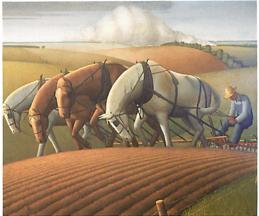
Corn Country, 1935